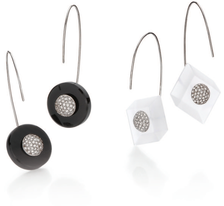
reverse fit round and square earrings

Yael Sonia's Deco Collection is inspired by the bold minimalism of the Art Deco movement. The fine clean lines of the gold structures support the pure geometry of the Brazilian gemstones, creating an optical sense of depth.