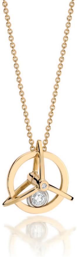
spinning top pendant