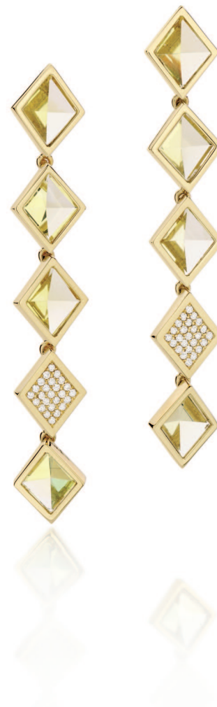
kite 5S earrings

Yael Sonia's Kite Collection is an extension of her famed Perpetual Motion Collection. The delicate and airy pieces are inspired by children's kites in the sky. The uniquely cut gemstones reflect light and give the jewels a luminous and sophisticated quality. The modern and bold design gives way to true elegance and style.