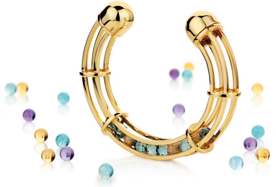
spinning curve kit cuff/pendant

Yael Sonia's Perpetual Motion collection is timeless, bold and sophisticated. The pieces are inspired by the kinetic movement of interactive children's toys. The rolling spheres, swinging pendulums and the spinning tops create jewelry that comes alive. A combination of architectural geometry and a whimsical flair results in a unique style of jewelry; melodic sounds are perpetually emitted with the wearer's movements.