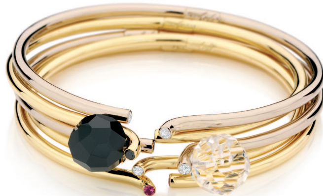
asymmetric fancy and asymmetric faceted brilliant fancy bangles