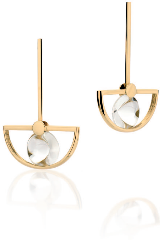
spinning top curve earrings