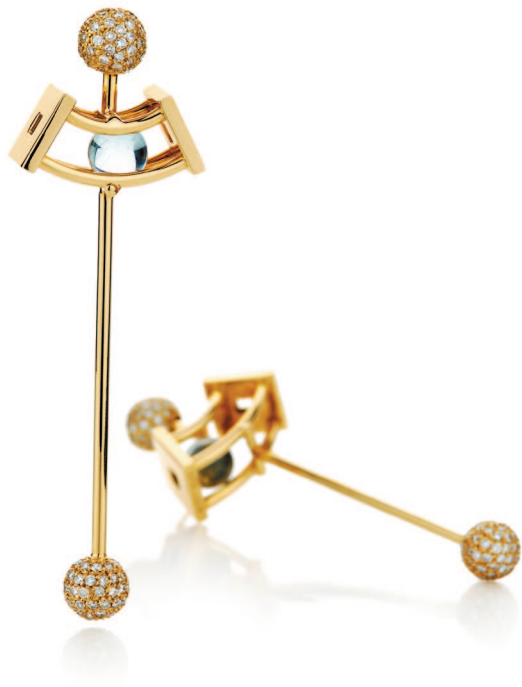
pendulum with ball earrings

18K yellow gold with blue topaz and diamonds