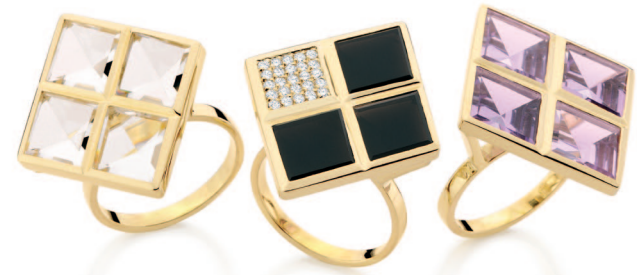
kite 4S rings

18k yellow gold with quartz, onyx with diamonds and amethyst