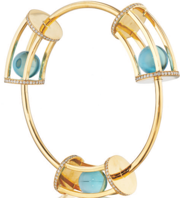
spinning trio bangle/pendant

18K yellow gold with blue topaz and diamonds