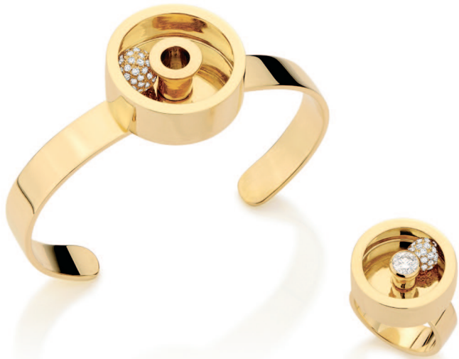
spinning ring and cuff