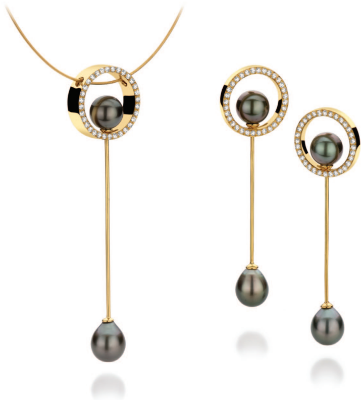
circle earrings and pendant

18K yellow gold with tahitian pearls and diamonds