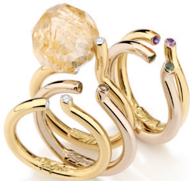
asymmetric fancy bands and asymmetric faceted brilliant fancy ring

18K gold with tourmalines, amethyst, rutillated quartz and diamonds