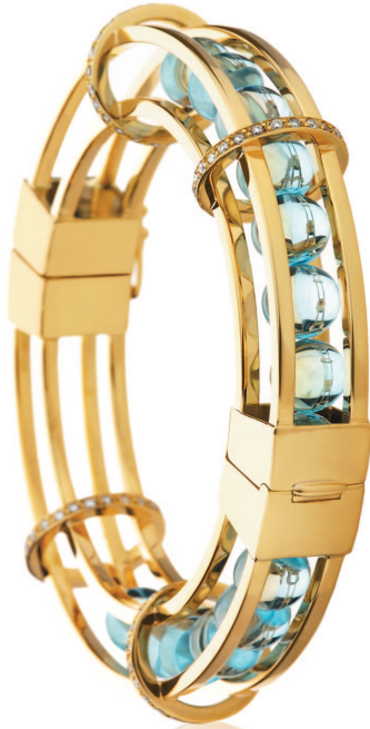
spinning wheel bracelet

18K yellow gold with blue topaz and diamonds