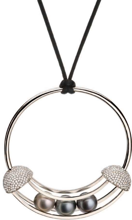
spinning curve bangle/pendant

18K white gold with tahitian pearls and diamonds