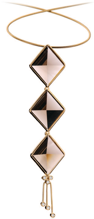
kite 3L pendant

18K yellow gold with smoky quartz and diamonds