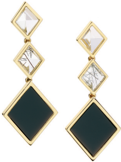
kite 2SL earrings

18K yellow gold with quartz, rutilated quartz and onyx